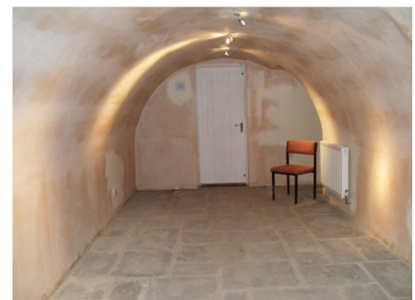
Plasterboard and a flagstone floor were laid over the membrane, leaving a high quality finish ready for decorating and furnishing