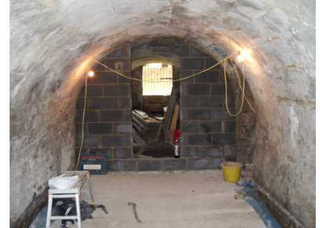
Prior to conversion, the vaults were damp and at risk of containing high levels of radon gas